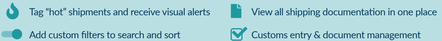
Proactive Alerts on Hot Shipments