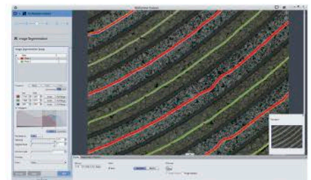
ZEN 2 core: imaging software for metallographic applications, such as Multiphase Analysis and Layer Thickness Measurement