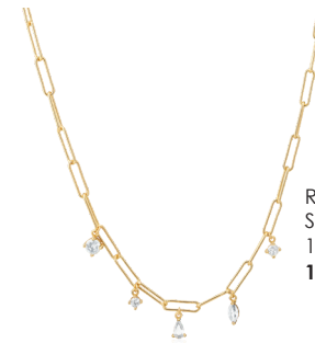
RIMINI NECKLACE SJ-N22122-CZ-SG 16704 1PC