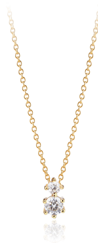
RIMINI DUE NECKLACE SJ-N22116-CZ-SG 16702 1PC