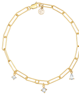
RIMINI BRACELET SJ-B22123-CZ-SG 16708 1PC