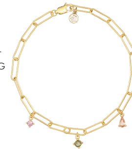
RIMINI BRACELET SJ-B22123-XCZ-SG 16710 1PC