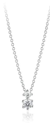
RIMINI DUE NECKLACE SJ-N22116-CZ-SS 16701 1PC