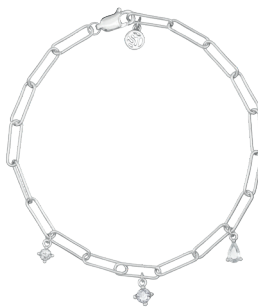
RIMINI BRACELET SJ-B22123-CZ-SS 16707 1PC