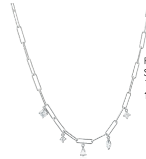
RIMINI NECKLACE SJ-N22122-CZ-SS 16703 1PC