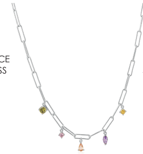
RIMINI NECKLACE SJ-N22122-XCZ-SS 16705 1PC