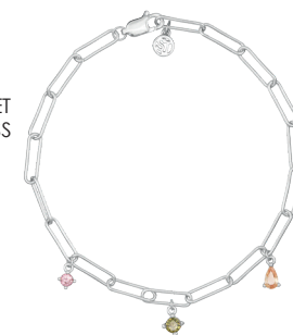
RIMINI BRACELET SJ-B22123-XCZ-SS 16709 1PC