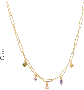
RIMINI NECKLACE SJ-N22122-XCZ-SG 16706 1PC