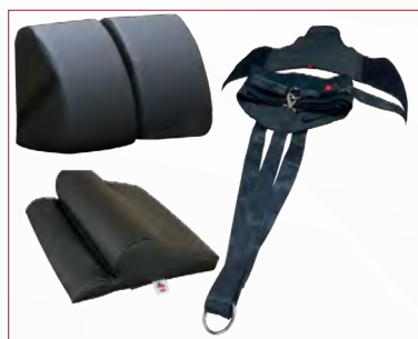
Knee & Cervical Bolster Set and Traction Belt