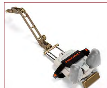
Cervical Attachment & Head Pillow