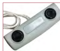
Dual Foot Control Pedal (x2) (S1077)