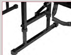
Height Range: 18.5-22.4"