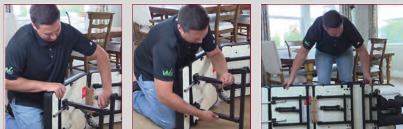
Adjustable Height Folding Legs