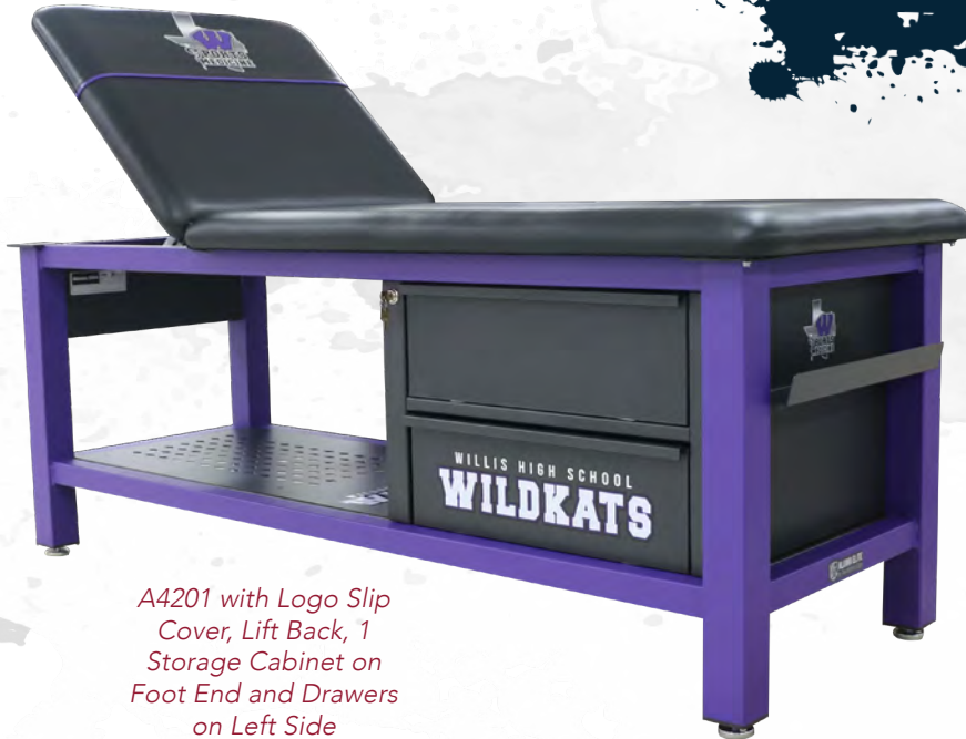
A4201 with Logo Slip Cover, Lift Back, 1 Storage Cabinet on Foot End and Drawers on Left Side

The Aluma Elite Treatment Table provides solid aluminum construction and an extraordinary load capacity of 750 lbs. Our tough, powder coat finish stands up to heavy usage and is available in 14 color choices with a custom graphics package included to make each table your own. Convenient tape holders are standard on each end of the shelf and provide improved functionality. An easy to clean surface makes this table ideal for athletic training rooms.