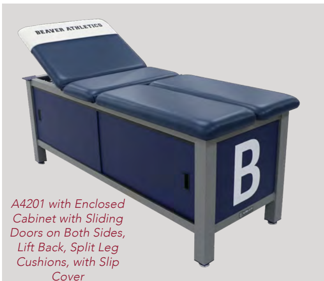
A4201 with Enclosed Cabinet with Sliding Doors on Both Sides, Lift Back, Split Leg Cushions, with Slip Cover