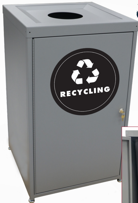
GB1001 with Recycling Opening and Custom Branding