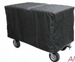
All Weather Cover