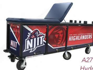
A2709 8' Hydration SmartCart