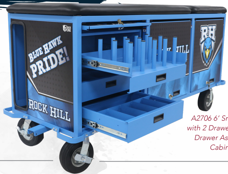
A2706 6' SmartCart with 2 Drawers 1 Tape Drawer Assembly Cabinet

The SmartCart™ is durable, functional and convenient. With its heavy-duty 1.25" tube steel frame, panel steel construction and ample storage, this product is sure to meet all your mobile taping, evaluation and/or treatment needs. Athletic Edge's SmartCarts are offered in many sizes to meet your game day and practice needs. Features include various cabinet and shelf configurations, large pass through storage areas, 360° rotating heavy duty locking wheels, a pull handle and 1.25" receiver hitch for ease of mobility. Graphics package includes custom graphics on all 4 sides of the cart.