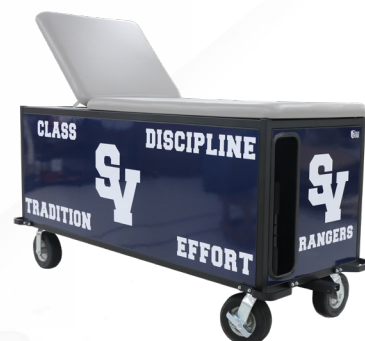
A2706 6' SmartCart