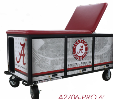
A2706-PRO 6' PRO SmartCart