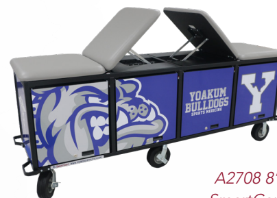
A2708 8' SmartCart