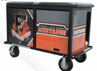
A2704 4' SmartCart