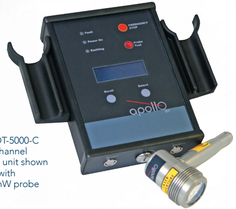
AP2-DT-5000-C 2-channel desktop unit shown with 5000mW probe

Cold laser therapy is a modality that has continued to grow in use over the past decade. Low-level laser technology safely penetrates 1 to 2 inches into the skin, which brings about more and reduces pain. Patients typically receive a series of treatments for conditions.