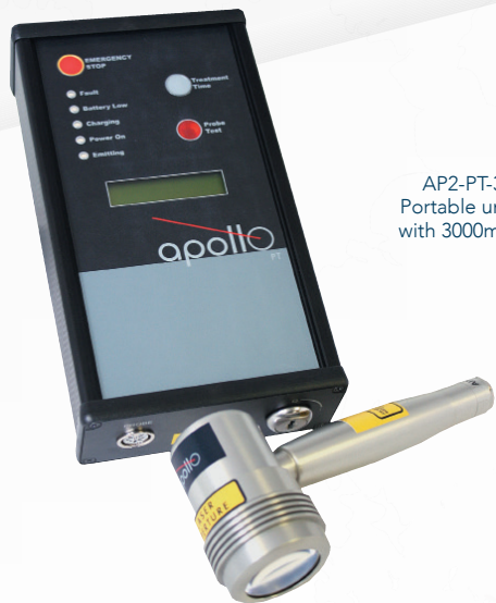
AP2-PT-3000-C Portable unit shown with 3000mW probe

Move easily from room to room or out in the field with the Apollo Portable Laser Unit. Designed for use by chiropractors, physical therapists, physicians, dentists and veterinarians, our portable unit weighs only 2.3 pounds but delivers powerful results: With a single overnight charge, you can perform up to 60 to 70 treatments. This portable unit also features a user-friendly LCD display with probe status and treatment times (ranging from 10 seconds to 2 minutes), built-in safety and fault detection software and a built-in power test to assess probe output.