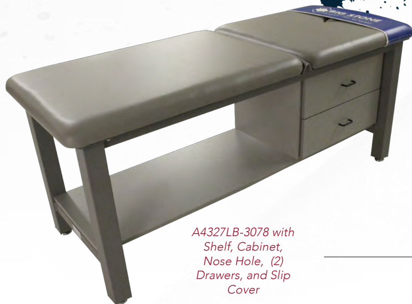
A4327LB-3078 with Shelf, Cabinet, Nose Hole, (2) Drawers, and Slip Cover

Custom build your aluminum treatment table to meet the specific needs of your athletic training room. The extraordinary load capacity of 650 lbs and the welded aluminum frame make the Aluma Elite Basic Treatment Table the perfect fit for athletic trainers and athletes alike. Each table comes standard with a welded aluminum frame, H-brace construction, comfortable 2" high density foam cushion, and softly rounded corners. Make it your own by adding length or width, laminate shelves or a cabinet that can be mounted on either end. Patient-friendly customizations include a nose hole and 70° manual lift back.