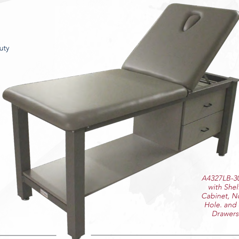
A4327LB-3078 with Shelf, Cabinet, Nose Hole, and (2) Drawers