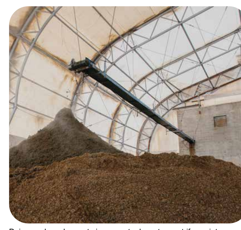
Dairymen have begun to incorporate decanter centrifuges into their manure management processes based on the advantages they deliver to separate manure solids.

Every dairy operation has a different configuration. However, a decanter centrifuge can be readily incorporated into