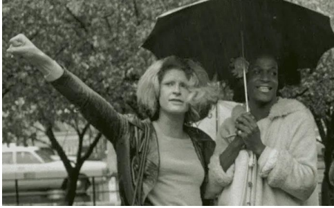
Marsha P Johnson & Sylvia Rivera