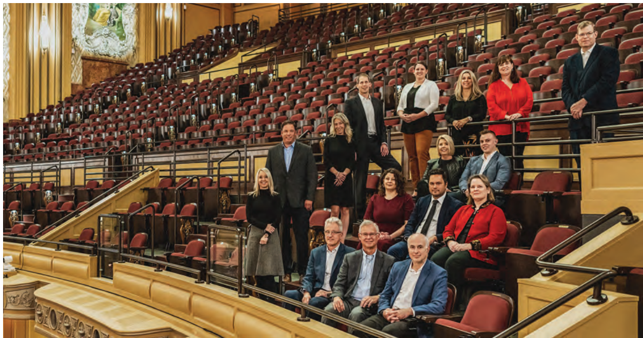
The Bradley Foundation staff at the Bradley Symphony Center, the new home of the Milwaukee Symphony Orchestra.