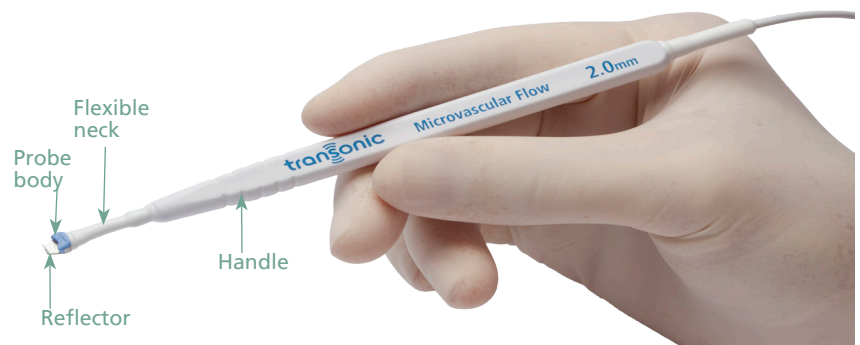
Fig. 3: 2 mm Microvascular Flowprobe showing handle and flexible probe neck for easy positioning of the Flowprobe around a vessel.