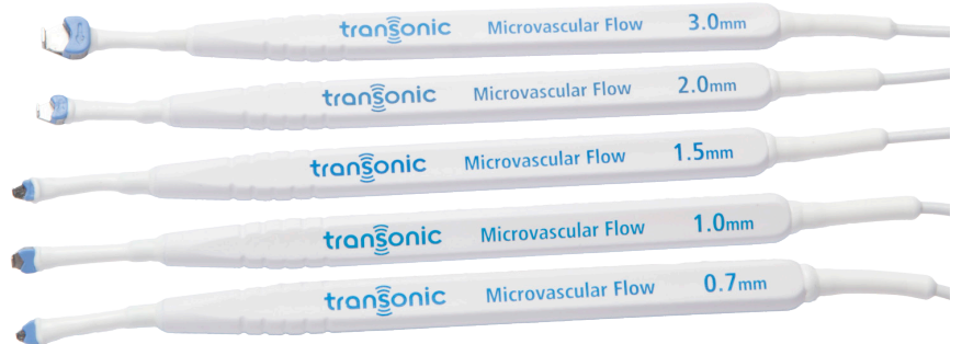
Fig. 4: Microvascular Flowprobe Series including 0.7 mm, 1 mm, 1.5 mm, 2 mm, 3 mm Flowprobes.