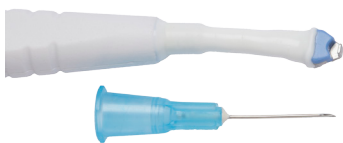
Fig. 2: Side-by-side comparison of a 0.7 mm Microvascular Flowprobe with a tip of a 25 gauge needle.