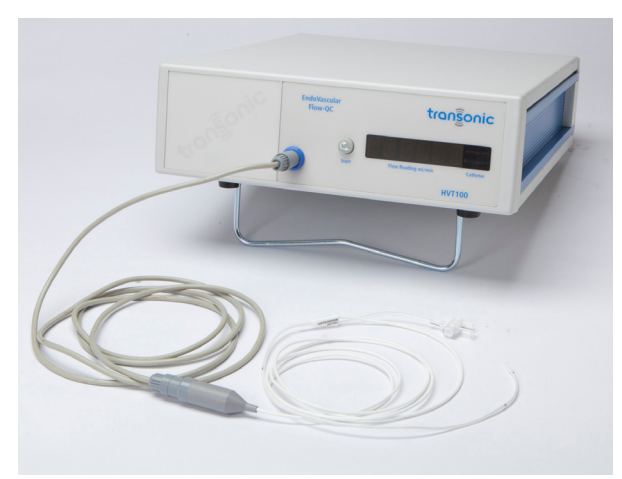
HVT100 Endovascular Flowmeter, extension cable and ReoCath® 6 F Antegrade Flow Catheter.