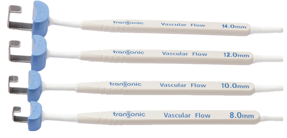
Vascular Flowprobes are available in 9 sizes: 1.5, 2, 3, 4, 6, 8, 10, 12, 14 mm.

Vascular Flowprobes are the most universally designed, and can be used for general vascular, transplant, and cardiac surgery. These flow probes feature a short flexible neck for applications where the artery, vein or graft is readily accessible. The J-style reflector is designed to quickly slip around the vessel and maintain optimal vessel alignment during flow measurement.