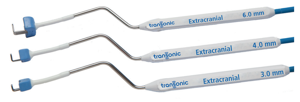
Extracranial Flowprobes are available in 3 sizes: 3, 4, 6 mm.

The short bayonet handled Extracranial Flowprobes are designed to be used under the microscope during EC-IC bypass surgery. Flow measurement can be used to quantify an increase in flow after a revascularization surgery for occlusive disease or to ensure the patency of a STA-MCA bypass.