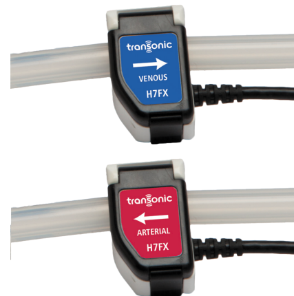
Clamp-on Tubing Sensors