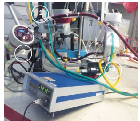
Transonic Tubing Flowmeter shown as integral component in ECMO circuit to continuously monitor flow through tubing. Flowsensors attached to the circuit.

Mosier JM, Kelsey M, Raz Y et al, "Extracorporeal membrane oxygenation (ECMO) for critically ill adults in the emergency department: history, current applications, and future directions," Crit Care. 2015;19:431. (Transonic Reference #EC11787AHR)