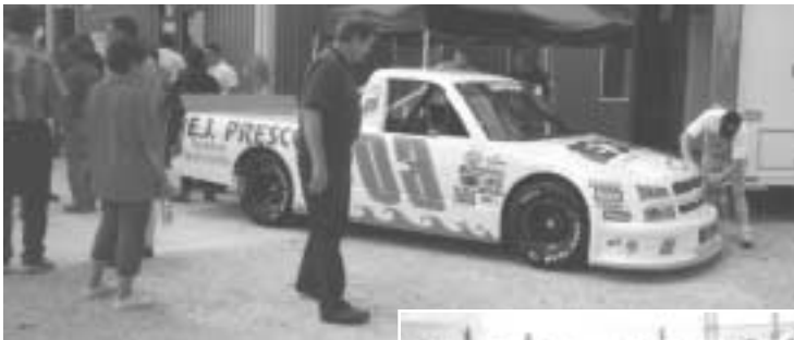
Customers admire the fastest truck in the West Indy fleet.