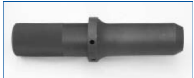
Combo Rounding & Flare Tool

For more information on these items and the 2002 catalog, please call Quality Water Products (800) 288-4668.