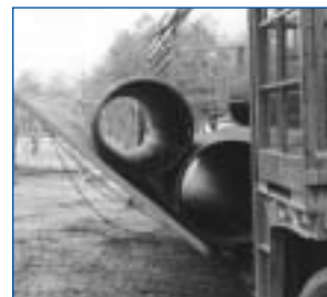
HDPE arriving at jobsite