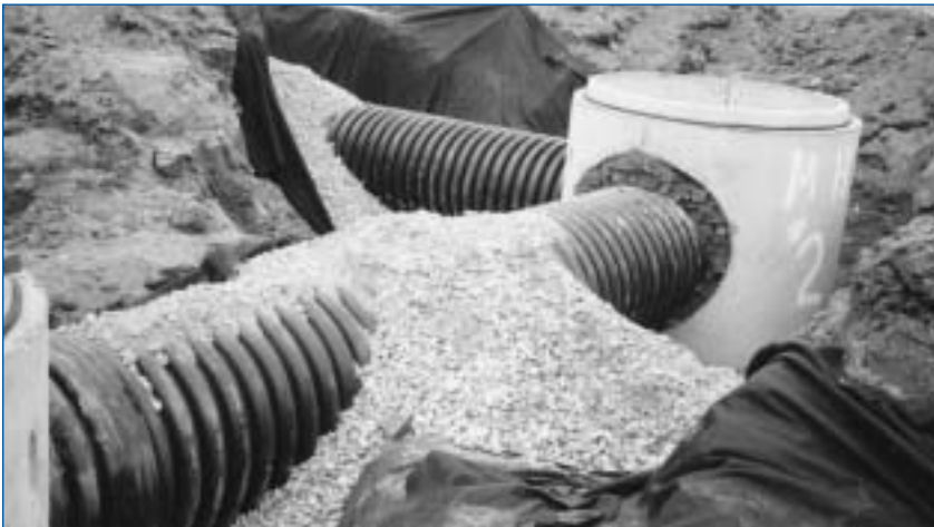
36-inch HDPE drainage header