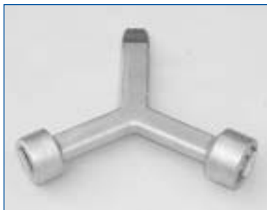
Pictured in above two photos: the new All-In-One Combo Key.