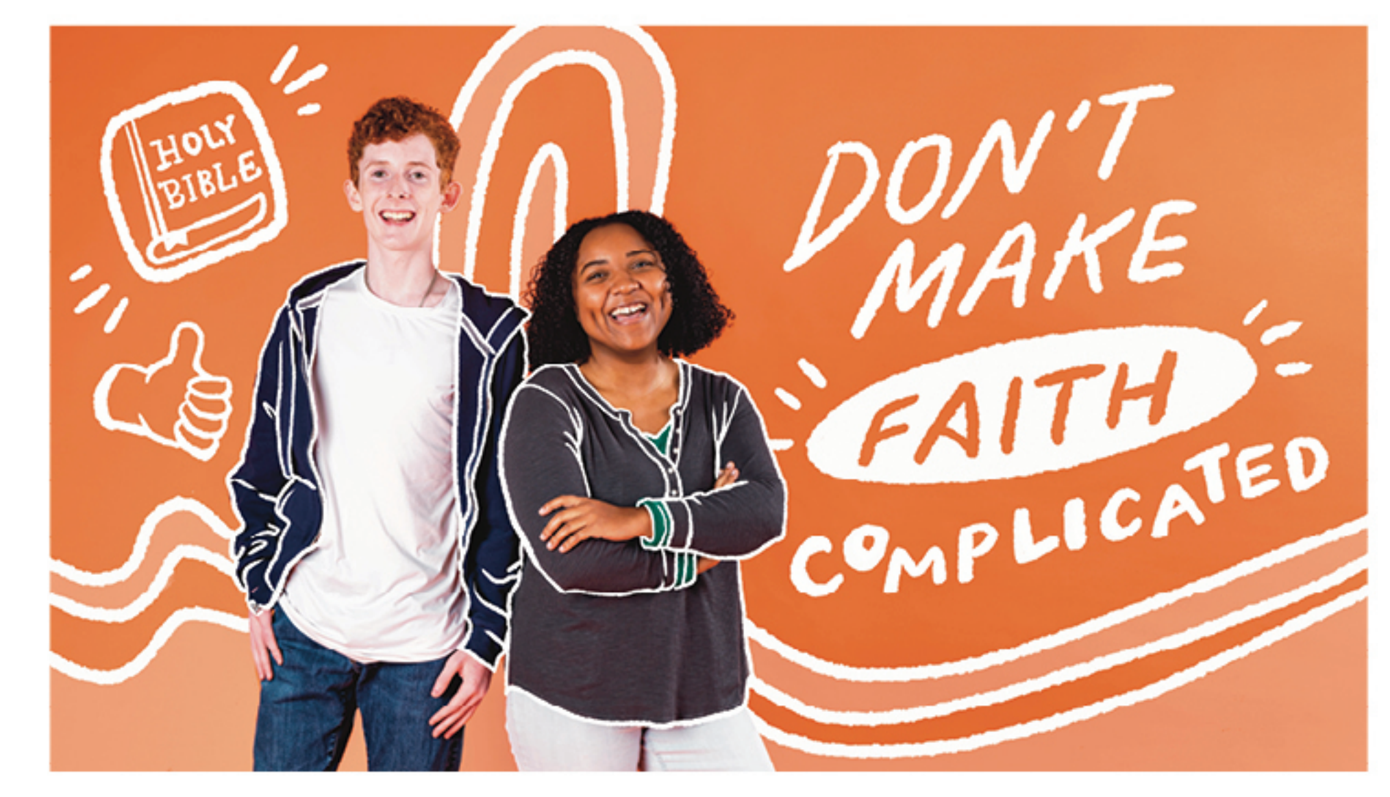
SIMPLIFY | A SERIES ABOUT WHAT JESUS SAID MATTERS MOST