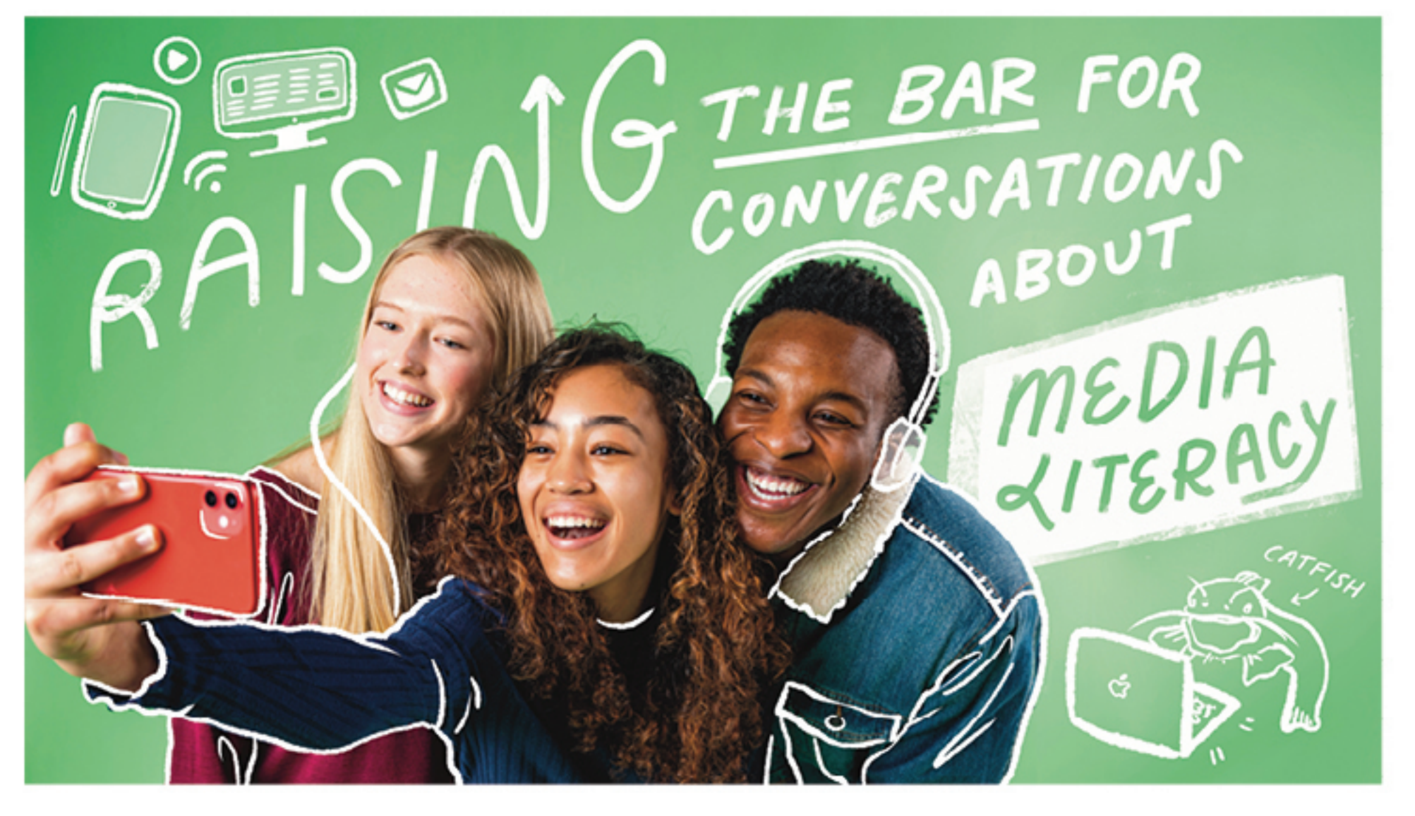
ELEVATE | A CONVERSATION ABOUT MEDIA LITERACY AND DISCERNMENT