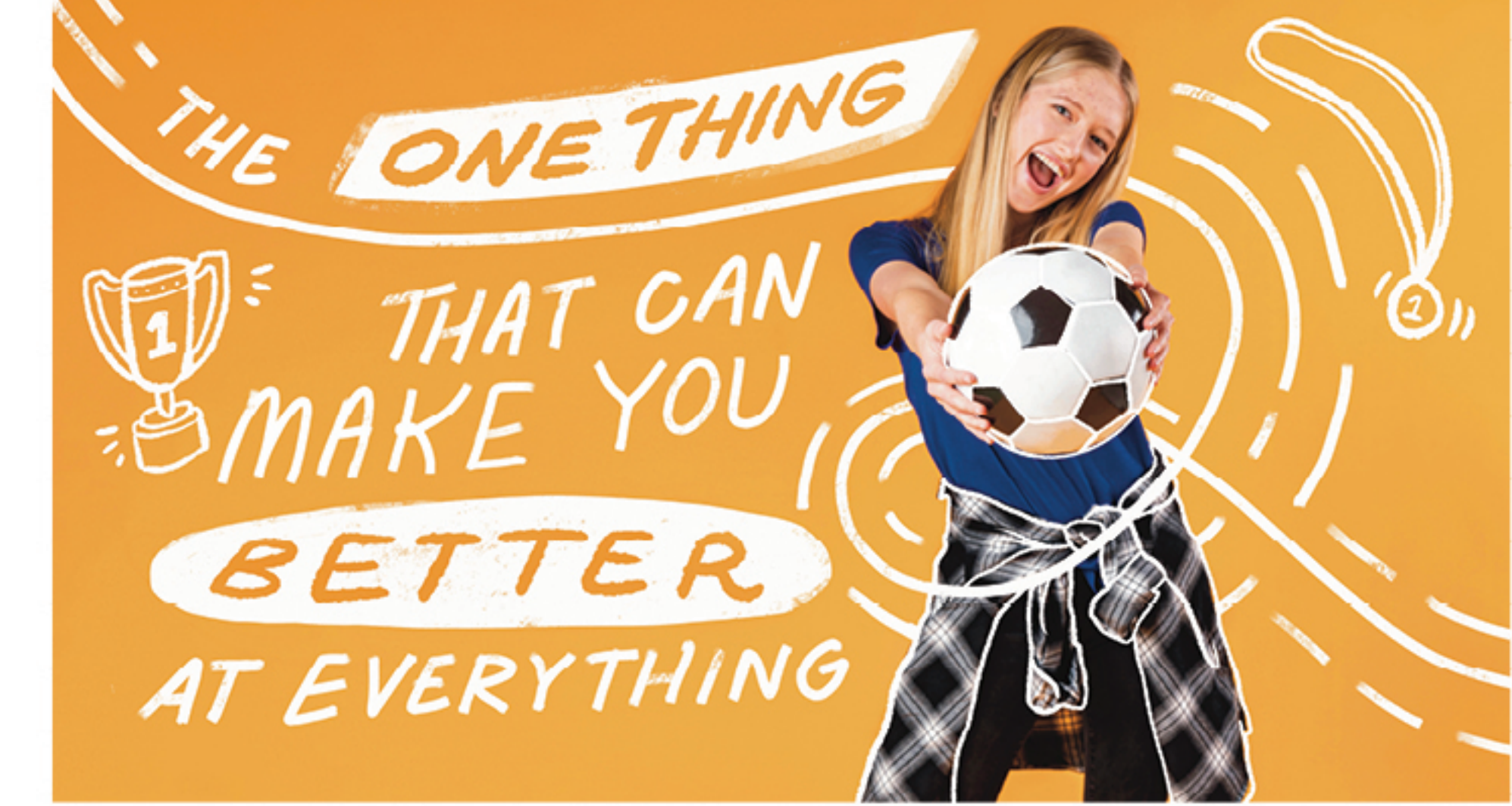
PRO TIP | A SERIES ABOUT WISDOM AND FAITH