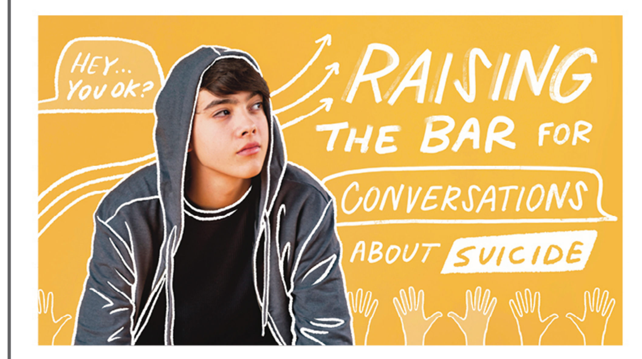
ELEVATE | A CONVERSATION ABOUT SUICIDE AND THE POWER OF REAL HOPE