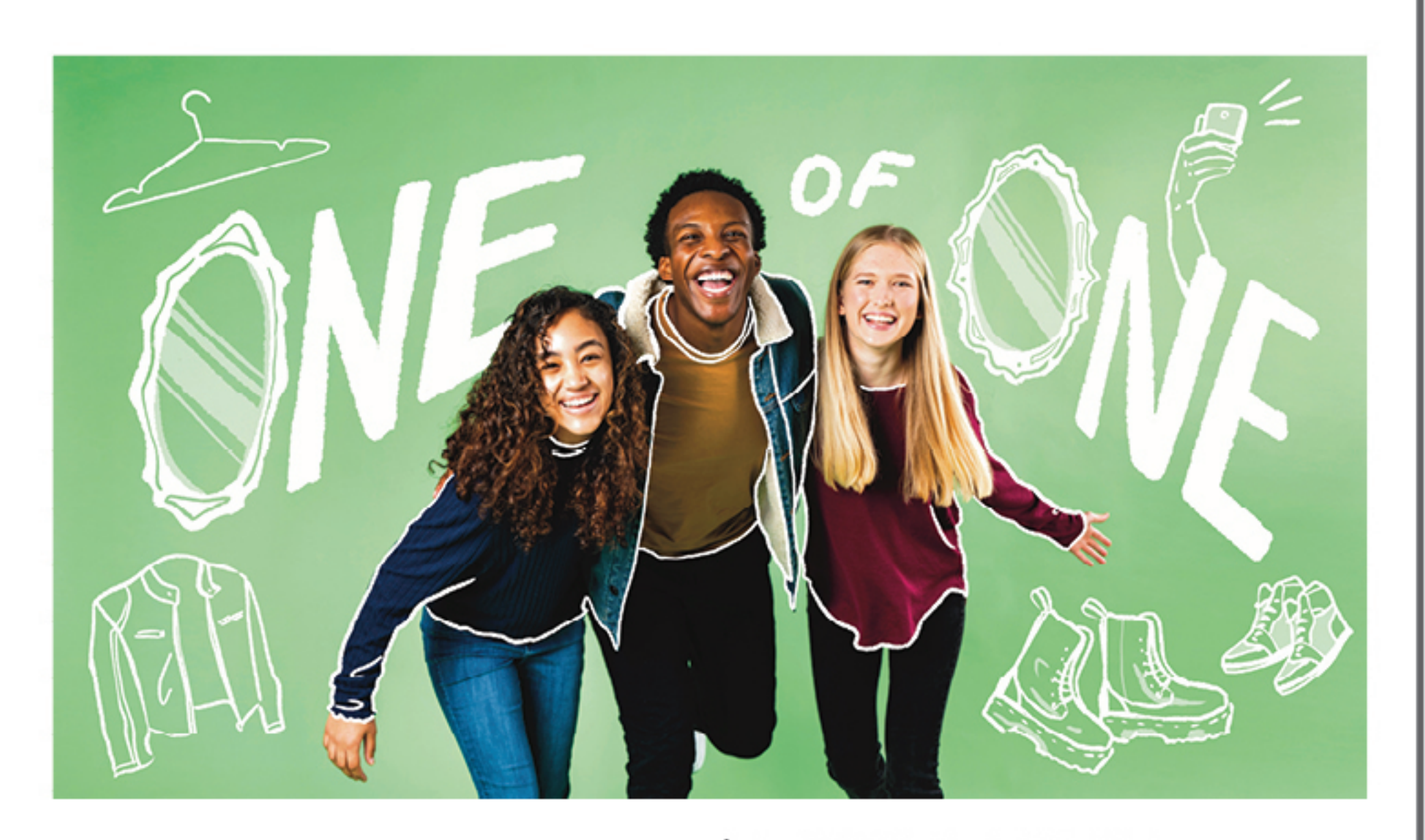
EXCLUSIVE DROP | A SERIES ABOUT OUR IDENTITY IN CHRIST