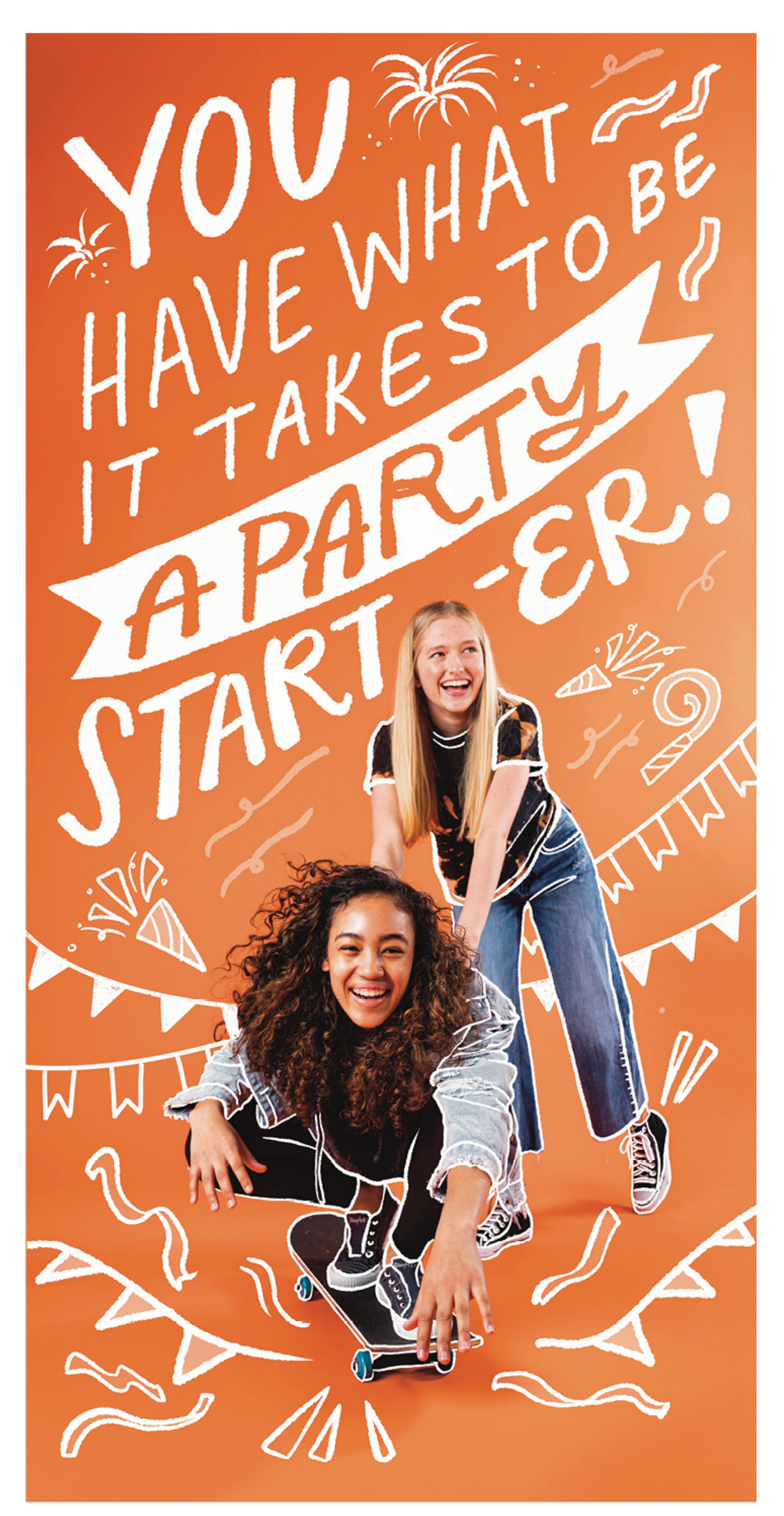
START THE PARTY | A SERIES ABOUT THE PROMISE JESUS MADE ABOUT GETTING THE MOST OUT OF LIFE