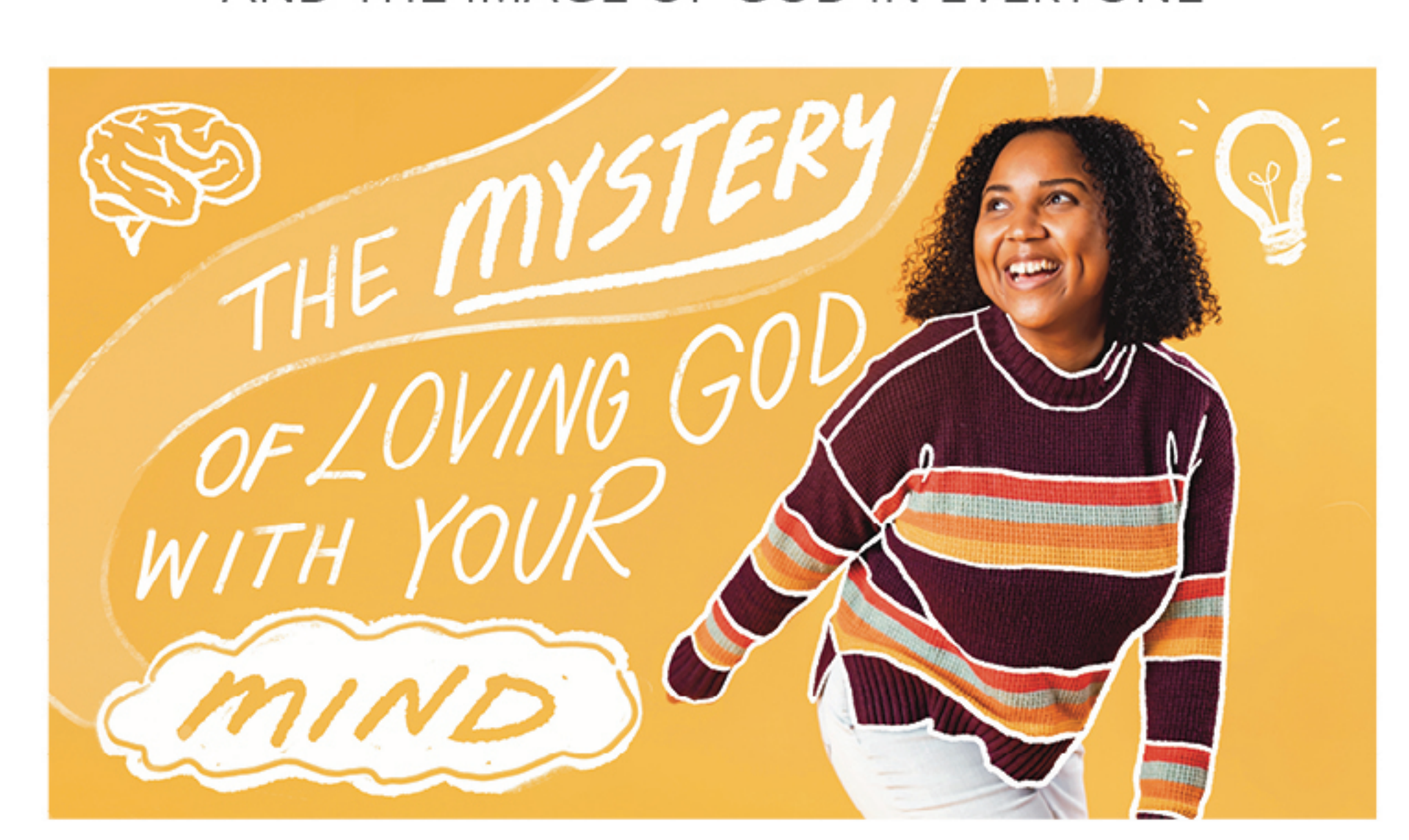
I WONDER | A SERIES ABOUT SCIENCE, FAITH, AND THE ONE WHO CREATED EVERYTHING