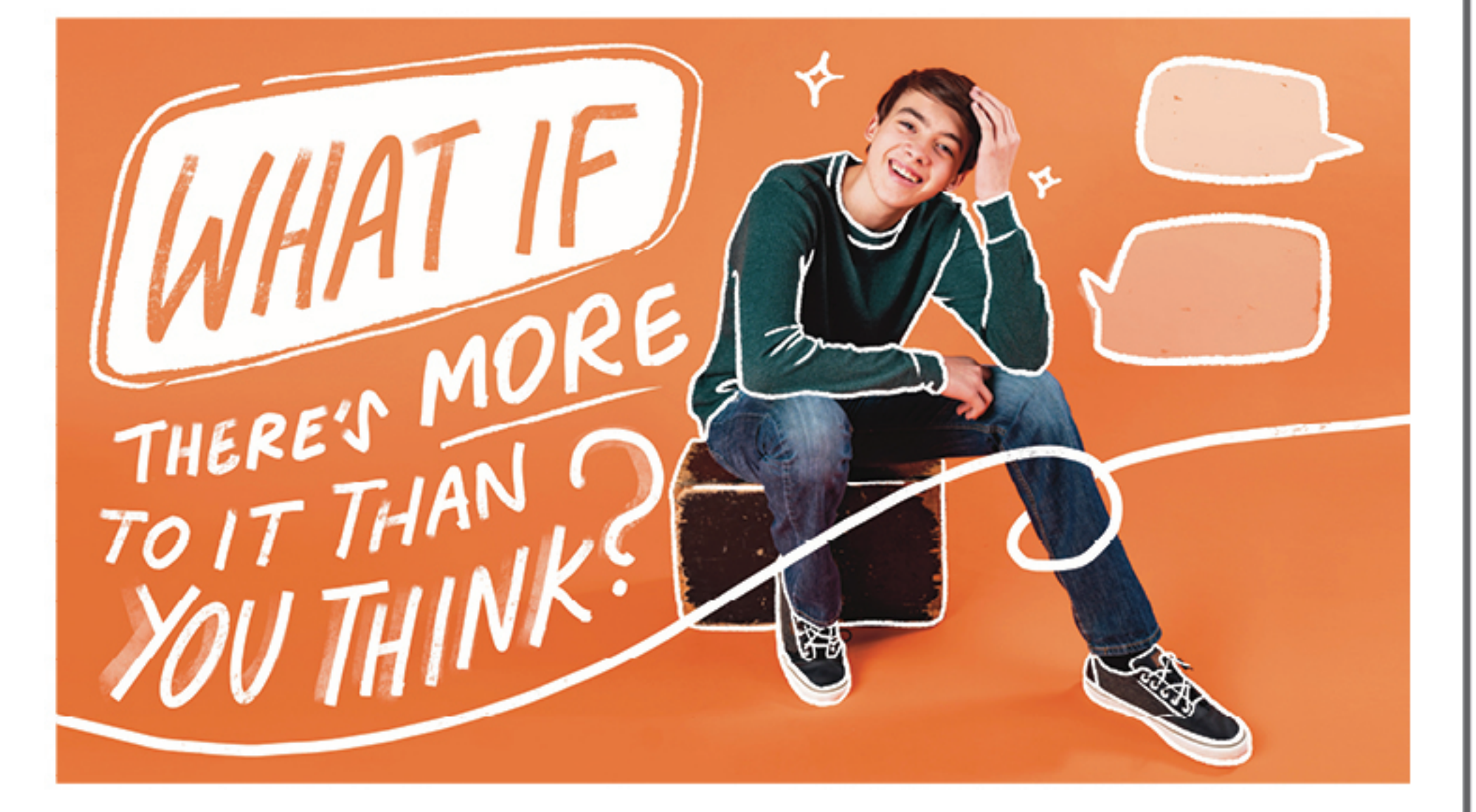
[THIS IS OUR SEX TALK] | A SERIES ABOUT GOD'S DESIGN FOR SEXUAL INTEGRITY