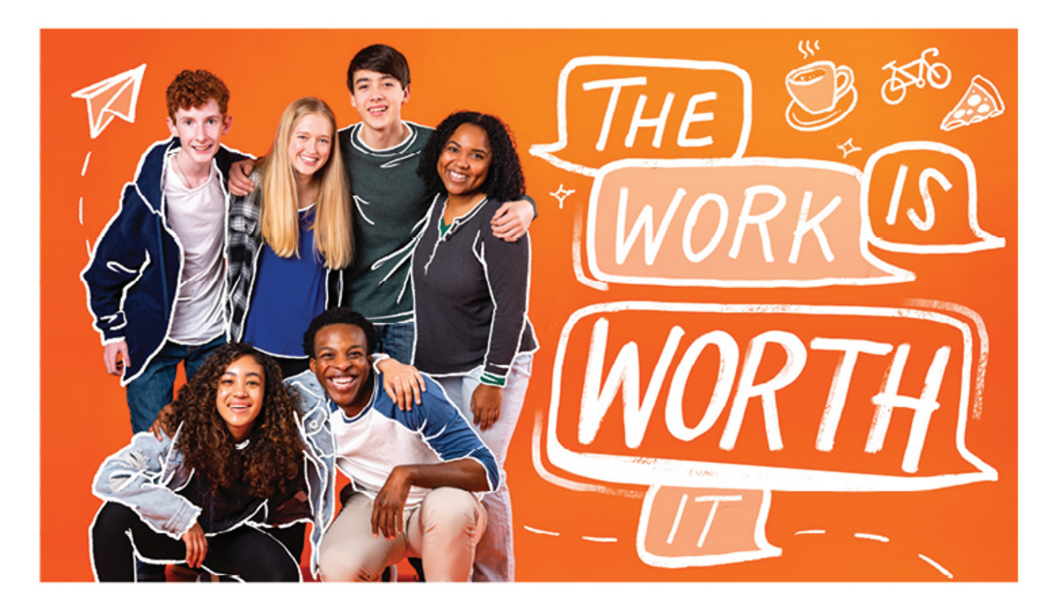
HOW TO FRIEND | A SERIES ABOUT FRIENDSHIP AND BIBLICAL COMMUNITY