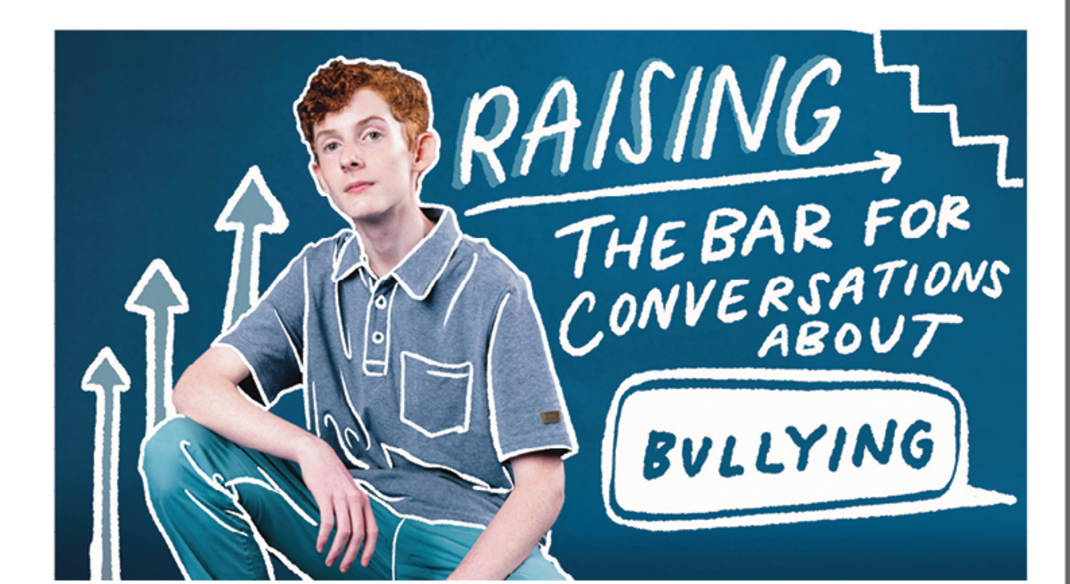
ELEVATE | A CONVERSATION ABOUT BULLYING AND THE IMAGE OF GOD IN EVERYONE