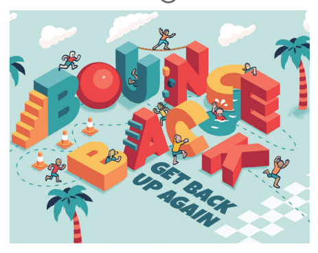
JUNE & JULY