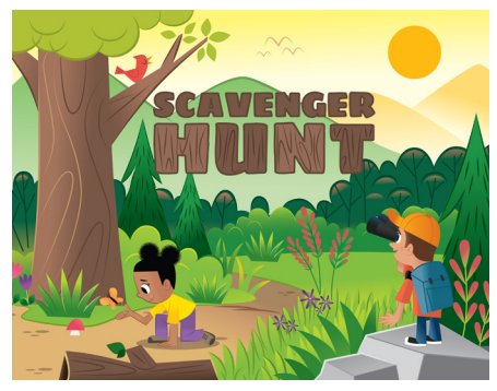
JUNE & JULY