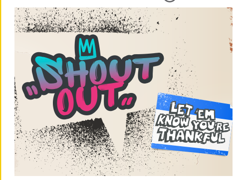
DECEMBER—CHRISTMAS (FX) JINGLE JAM