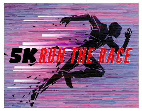
JUNE & JULY—CONFIDENCE