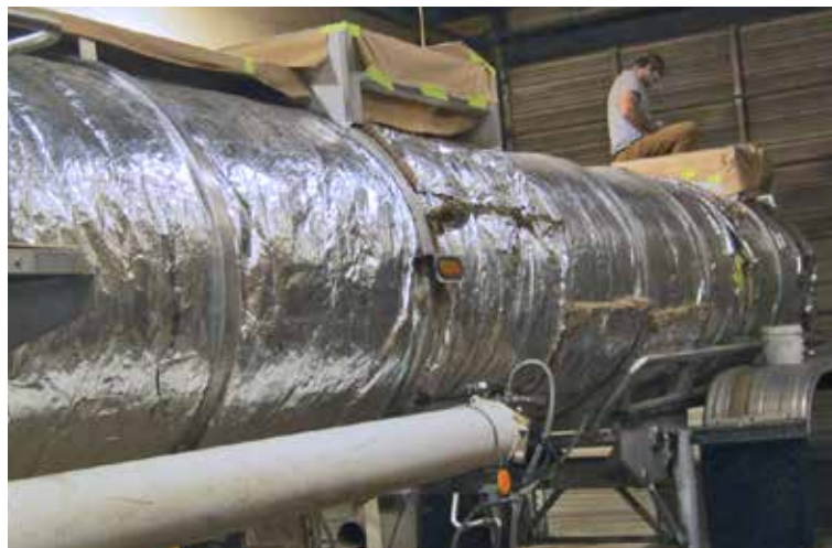
UCC prepares an OTR tank for heat curing of the ChemLine® 784/32 lining.

Prior to ChemLine®, UCC was mostly applying Baked Phenolic coatings for Sulfuric service. However, after 3 to 4 years in service, the Phenolic coating would break down in some places in the tank, especially in the vapor areas. "We noticed that other coatings have a limited range of service. ChemLine® delivered a better corrosion solution for Universal Coatings and our tank trailer customers," Myers states. He adds that UCC customers really like the cargo carrying flexibility of the ChemLine® 784/32