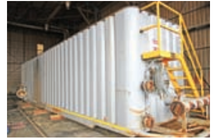
HCl storage tank at Viking Chemicals.

Viking Chemicals, a global service company engaged in oil and gas drilling and completion, well servicing, pressure pumping, wireline, geophysical, civil engineering and transportation, needed assistance for a tank lining operation to handle Hydrochloric Acid, a chemical that causes severe corrosion.