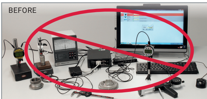
Conventional measuring station –with cable connection