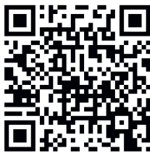
Scan the QR code to watch simple and practical applications