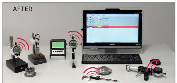
Innovative measuring station – with Integrated Wireless