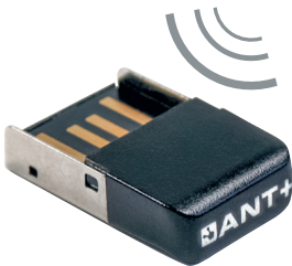
The MarConnect i-Stick