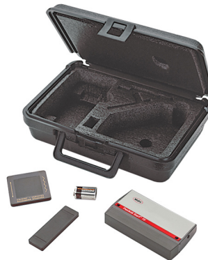
Pocket Surf IV complete kit