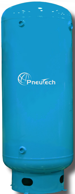
Vertical Receiver Tanks