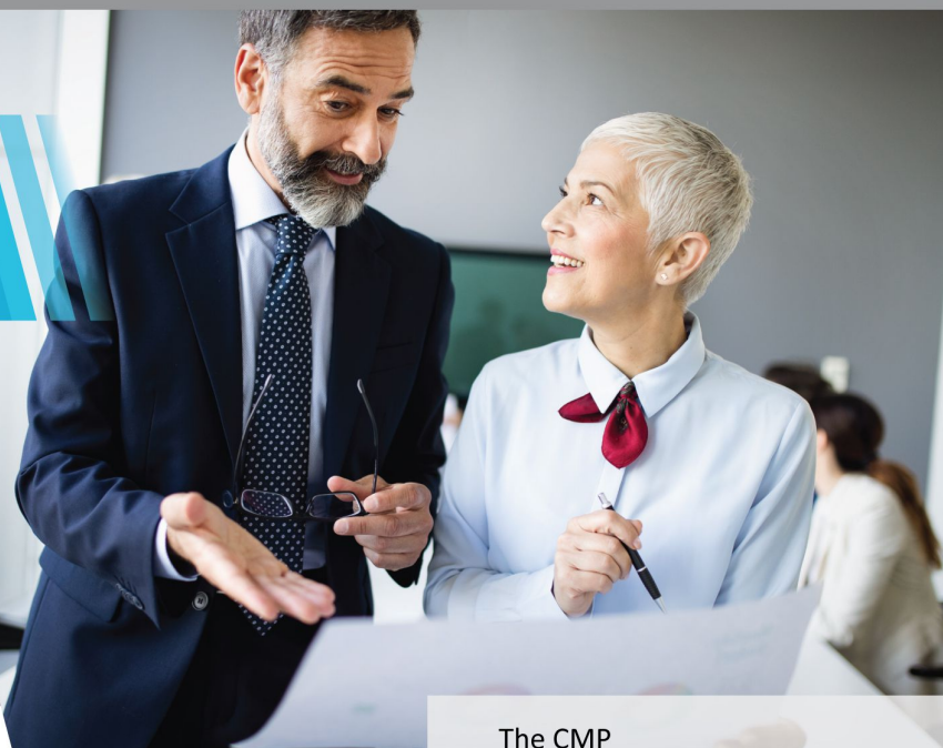
The CMP Executive Assessment Advantage

The power of prediction – that is the CMP Executive Assessment Advantage.