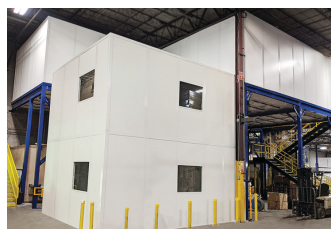
MEZZANINES / IN-PLANT OFFICES