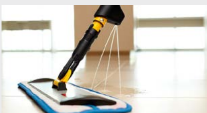
Hygen™ Pulse™ Microfiber Spray Mop Kit (020570)