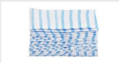
Hygen™ Disposable Microfiber Cloths (029140 – 60 ct)

The new disposable microfiber is compatible with bleach, quat and hydrogen peroxide disinfectants and has built-in scrubbing strips to help remove dirt more effectively. The new disposable cloths and mops help reduce cross-contamination because they can be thrown away after each area or task. They can be used dry or wet.