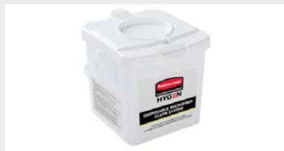
Hygen™ Disposable Microfiber Cloth Charging Tub (029160)