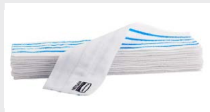
Hygen™ Disposable Microfiber Pads – 18 in (029150 – 50 ct)