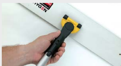
Hygen™ Quick Connect Frame – 17 in (020478)