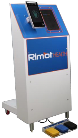
Foot Response Pedals

Organizations need on-site health status awareness to help protect essential workers and operations from virus threats. Real-time data facilitates risk awareness and informs operational decision-making. It is crucial to mitigate and manage community and site spread.