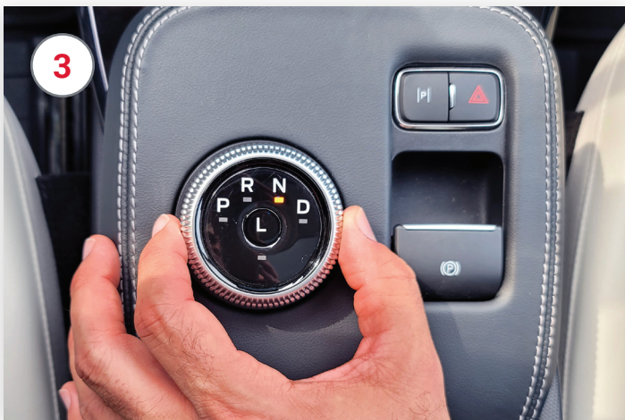
3 Shift vehicle to " N " Neutral with rotary shifter in center console