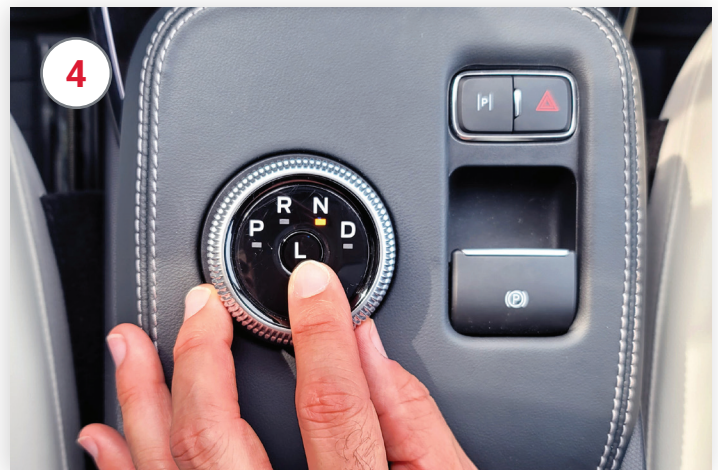
4 Press " L " in center of rotary shifter