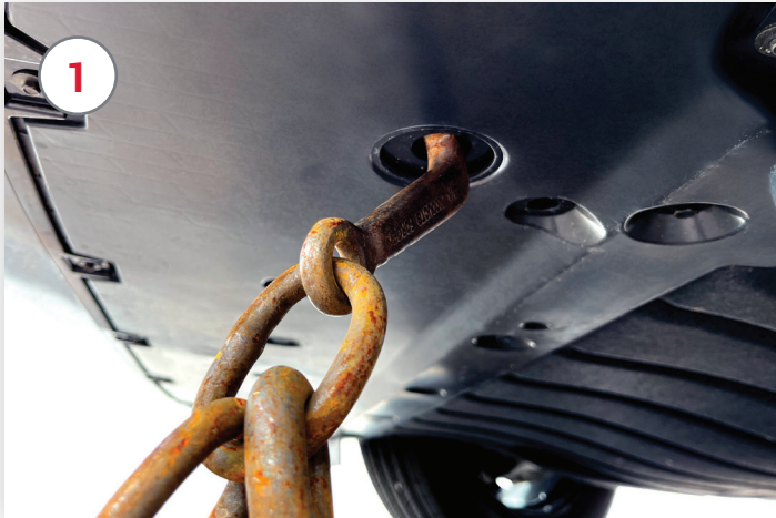
1 Make connections to the disabled Mustang Mach-E at the round openings under front bumper

Prior to activating "Neutral Mode" make all connections to tow truck to prevent roll away.