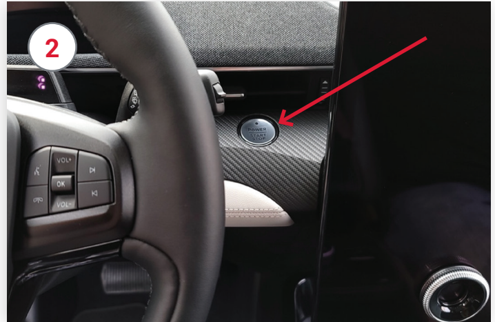
2 With Key Fob present press " Start " button to power up vehicle