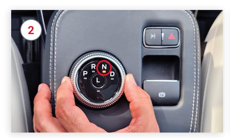
The shifter dial and dash cluster will indicate neutral (N)