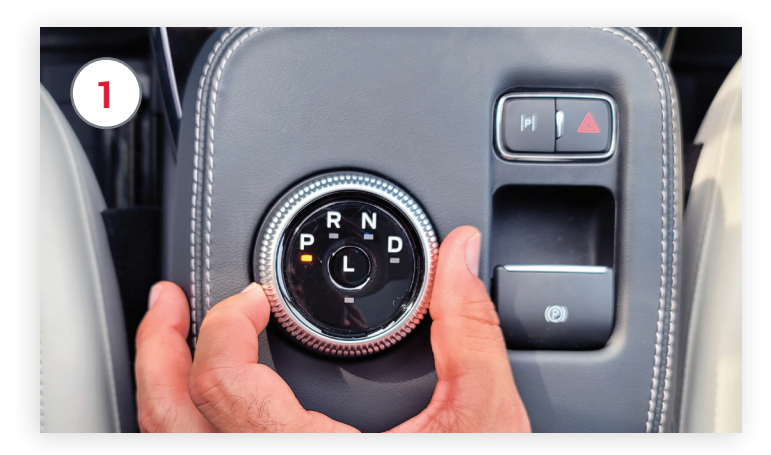
Enter vehicle with key fob present and depress foot brake. Shift vehicle to neutral with rotary shifter in center console.

Prior to activating "Neutral Mode" make all connections to tow truck to prevent roll away.