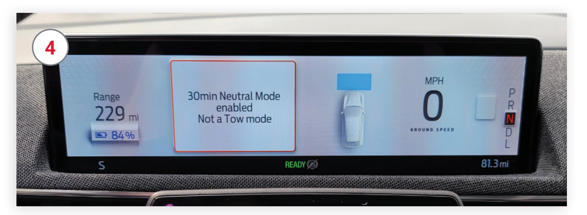
Dash cluster will indicate "Neutral Mode"

Vehicle will remain in neutral for 30 minutes or until returned to park