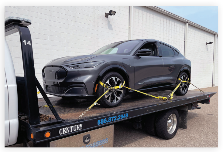
Retain and transport only using 8-point carrier kit