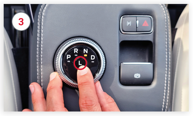
Press (L) button in center of shifter dial