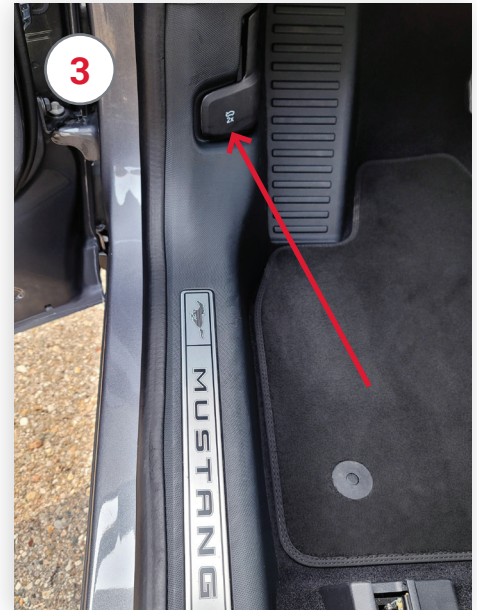
3 Pull front luggage compartment release twice to fully release front cover for opening.