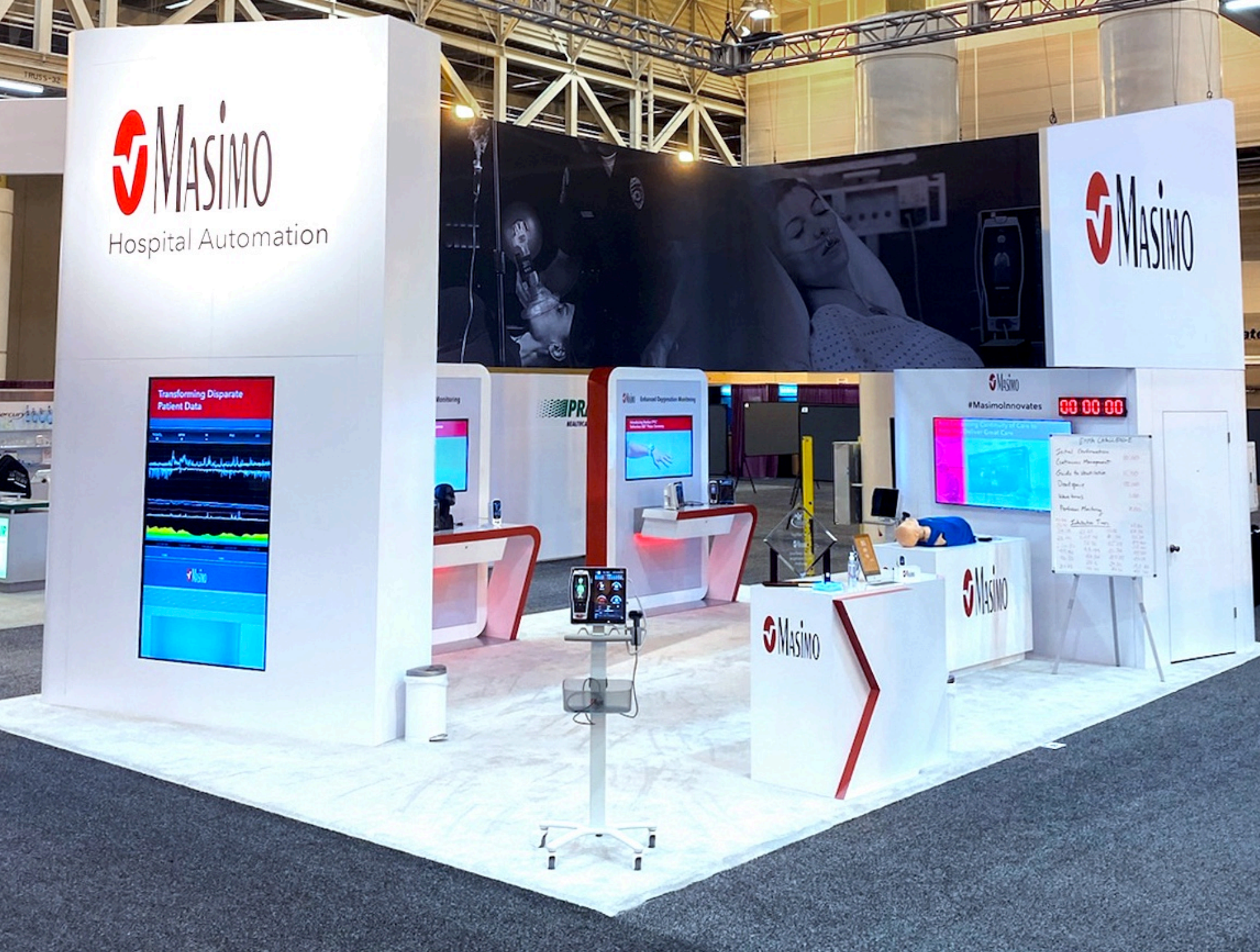
Smaller modular island booth