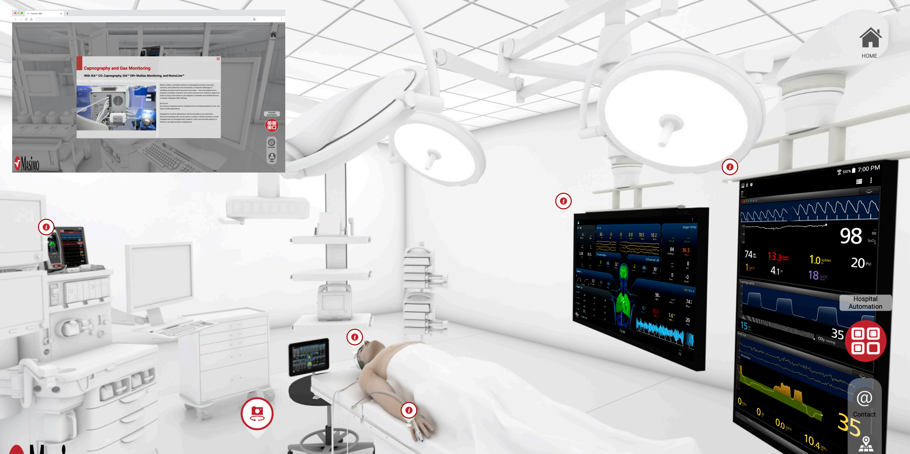
Virtual surgical suite