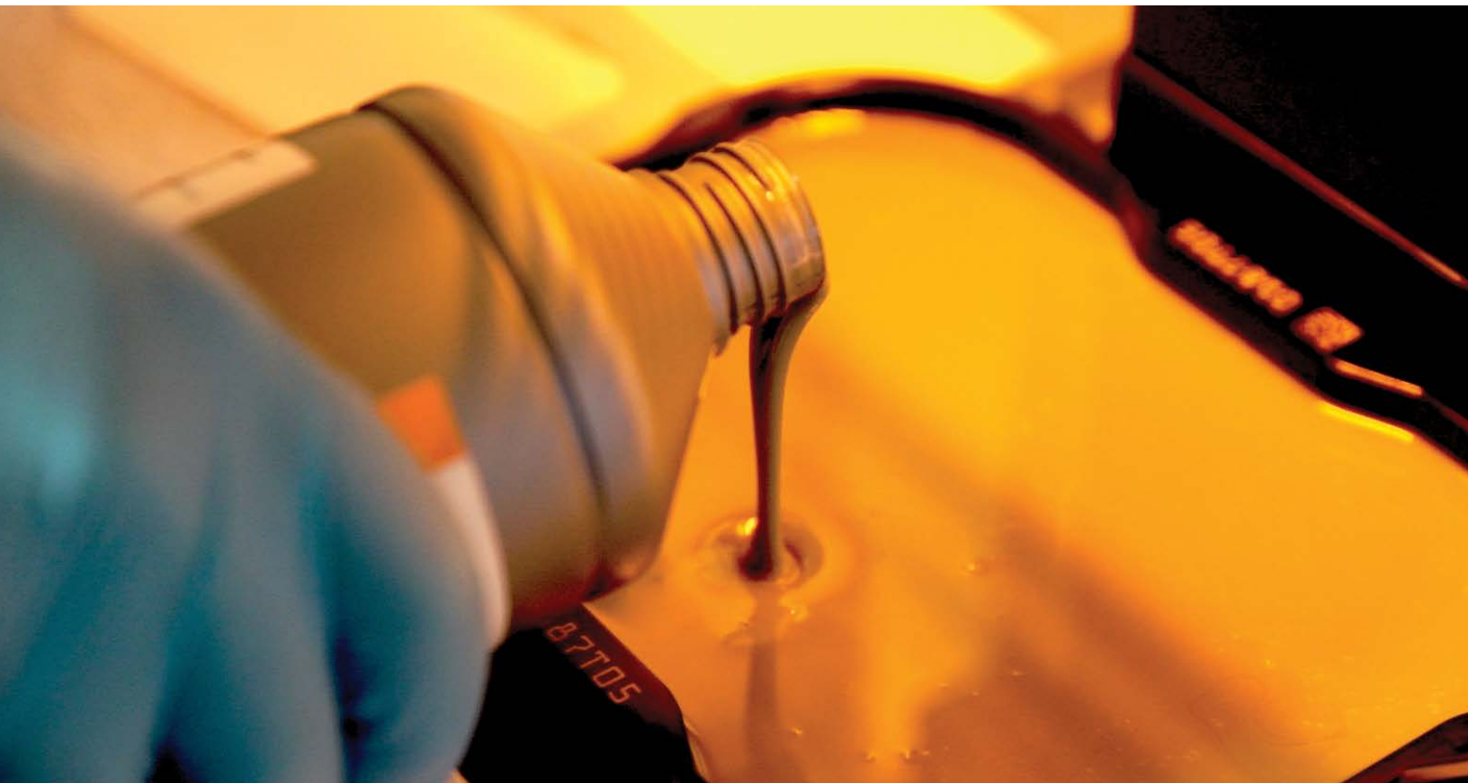
Figure 4 Standalone enables material to be allocated based on job requirements.

The print speed offered by Figure 4 Standalone has enabled the contract manufacturer to extend its cutoff time for same-day shipping by four hours, from 8AM to noon. “Not a lot of machines in the market today give you that capability,” says McLean. “The speed at which we’re able to produce parts on Figure 4 Standalone allows us to turn parts around and keep the machine busy, reducing our overhead costs per part and passing benefits along to our customers.”