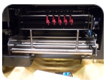
Easy front load film cradle with pin wheel hole punch