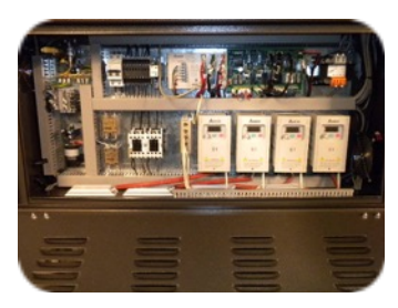
Easy access control panel