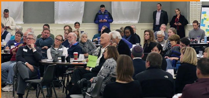
Kansas City elected officials taking the Reversing Global Warming workshop.