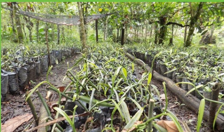
Vanilla cultivation as an economic alternative is part of the bio-regional plan.