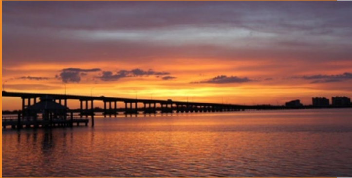
The Caloosahatchee River in Florida.