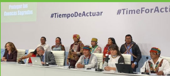
Indigenous leaders presenting ASHI at the 2019 UN COP Climate Conference.