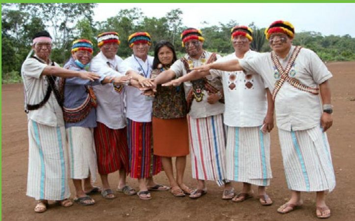
Indigenous leaders gathered in the rainforest.