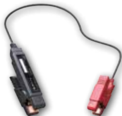
BLUETOOTH® ENABLED BATTERY ANALYZER