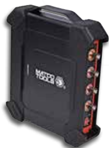
HIGH LEVEL 4-CHANNEL OSCILLOSCOPE

Includes 4-Channel Oscilloscope, battery analyzer and access to the MaxFix repair database.