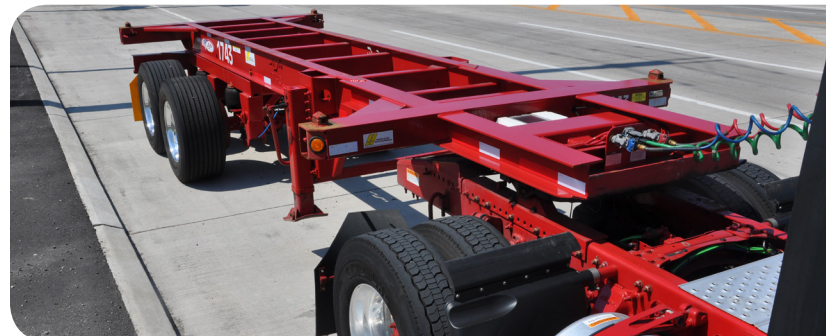
SalSon's chassis fleet is maintained by a network of company-owned maintenance centers.