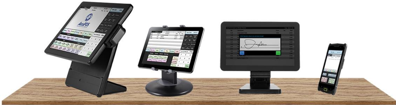
Touch Screen PC POS