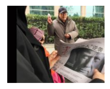
Donald Trump is a mixed blessing for leaders