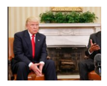
'Excellent' first meeting for Obama.