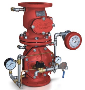
Preaction Alarm Valve

A requirement of NFPA 25, 14.2 (the standard for fire sprinkler inspections) is that every three years you are also required to do the following: