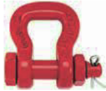
S-252 BOLT TYPE SLING SHACKLE