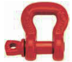
S-253 SCREW PIN SLING SHACKLE