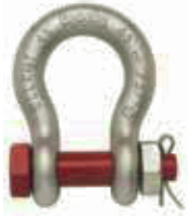
G-2130 / S-2130

G-2130 Bolt Type Anchor shackles with thin head bolt - nut with cotter pin. Meets the performance requirements of Federal Specification RR-C-2.7-1F Type IVA, Grade A, Class 3, except for those provisions required of the contractor.