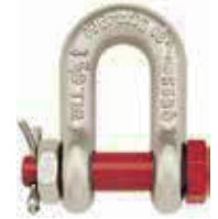
G-2150 / S-2150

G-2150 Bolt Type Chain shackles. Thin head bolt - nut with cotter pin. Meets the performance requirements of Federal Specification RR-C2.7-1F Type IVB, Grade A, Class 3, except for those provisions required of the contractors.