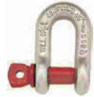
G-210 / S-210

G-210 Screw pin chain shackles meet the performance requirements of Federal Specification RR-C-2.7-1F, Type IVB, Grade A, Class 2, except for those provisions required of the contractor.