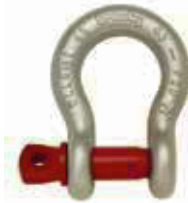
G-209 / S-209

G-209 Screw pin anchor shackles meet the performance requirements of Federal Specification RR-C-2.7-1F Type IVA, Grade A, Class 2, except for those provisions required of the contractor.