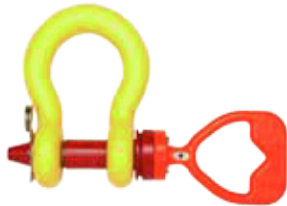
G-209R with “D” Style Handle Shown